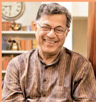
Shri Girish Karnad, Great Theatre personality

NATIONALISM & INTERNATIONALISM incorporated in the daily Assembly / Special Assembly.