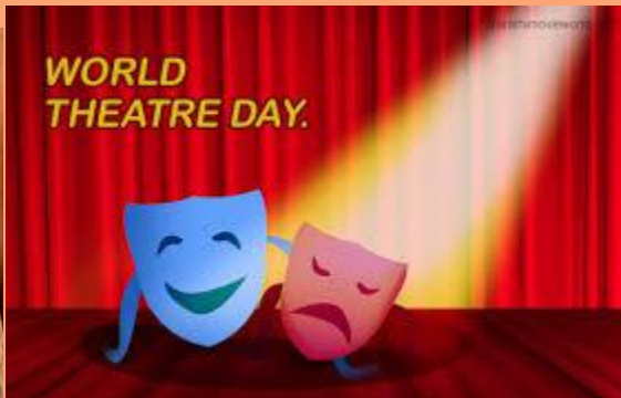
World Theatre Day