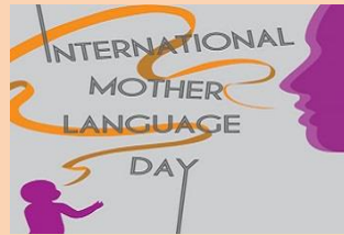
International Mother Language Day